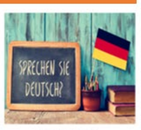
German language skills