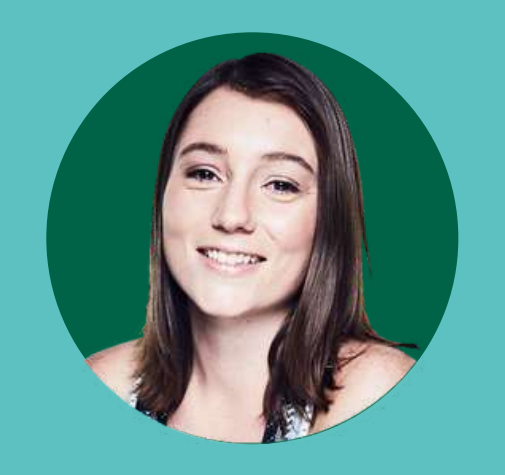
FOUNDER & CEO GREEN IS THE NEW BLACK, ASIA

Delegates can learn more about critical thinking and putting climate action at the forefront of business decisions, policy-making, law and government.