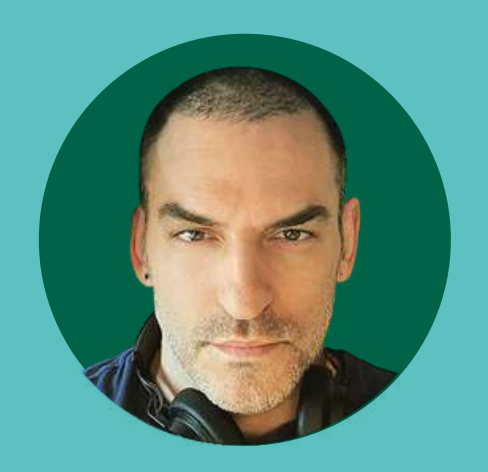
CLIMATE ACTIVIST & DESIGNER THE PUBLIC SOCIETY, NEW YORK

Delegates will learn about sustainability in the intersection of the tech industry, food security and nature conservation. They will discover more about app creation and relevant career advice.